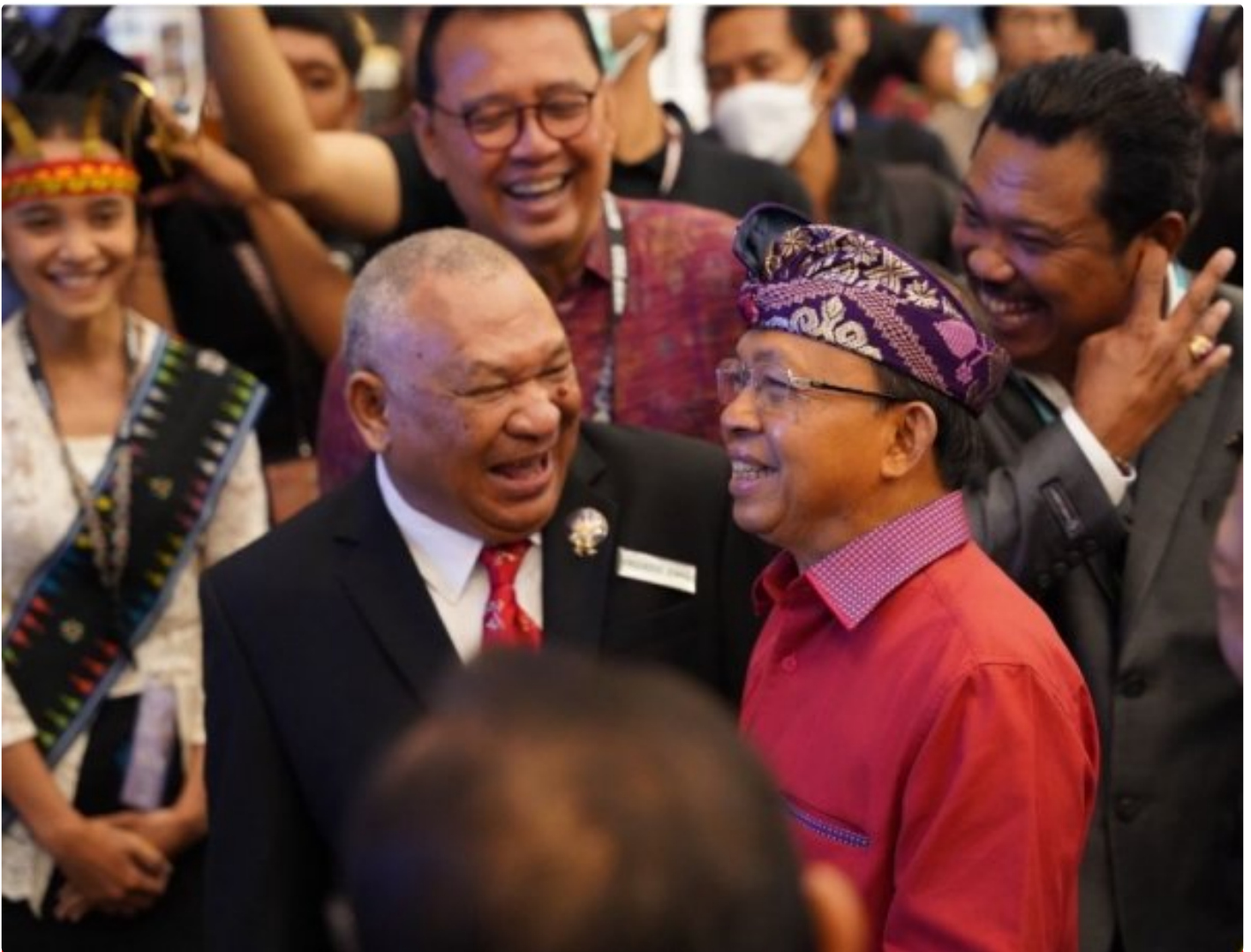
Bali & Beyond Travel Fair 2023.

BALI - The 9th Bali and Beyond Travel Fair (BBTF) TRAVEX was officially inaugurated by the Governor of Bali, Wayan Koster who has a deep concern for the tourism Industry, accompanied by the representative of the ministries, local government officials, tourism stakeholders, private sectors, associations,